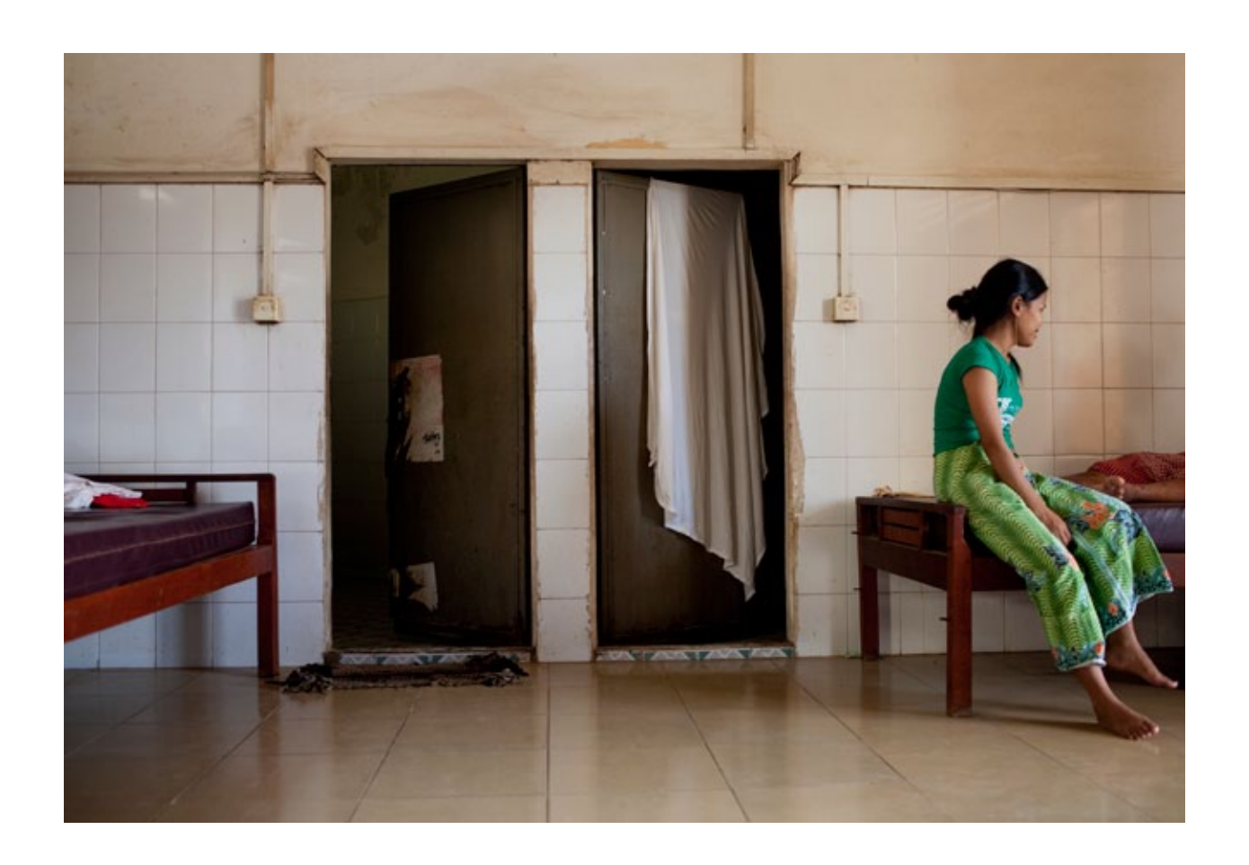
Interviewees regretted the Cambodian mental health system's overreliance on medication as the sole method of addressing the needs of patients. Above, a relative speaks with a mental health patient at the Khmer-Soviet Friendship Hospital in Phnom Penh.

colleagues at these health facilities were interested in mental health, which often left them to handle the large volume of new and recurring mental health patients with little assistance. One mental health professional outside Phnom Penh commented: "The current staff is not enough . . . I see 400 patients a month." <sup>267</sup> "[T]he resources don't meet the need," confirmed another mental health professional in Battambang Province. <sup>268</sup> Another added, "the government doesn't want to spend money on mental health services. For other services like body disease, they spend a lot. For mental health it is little." <sup>269</sup>