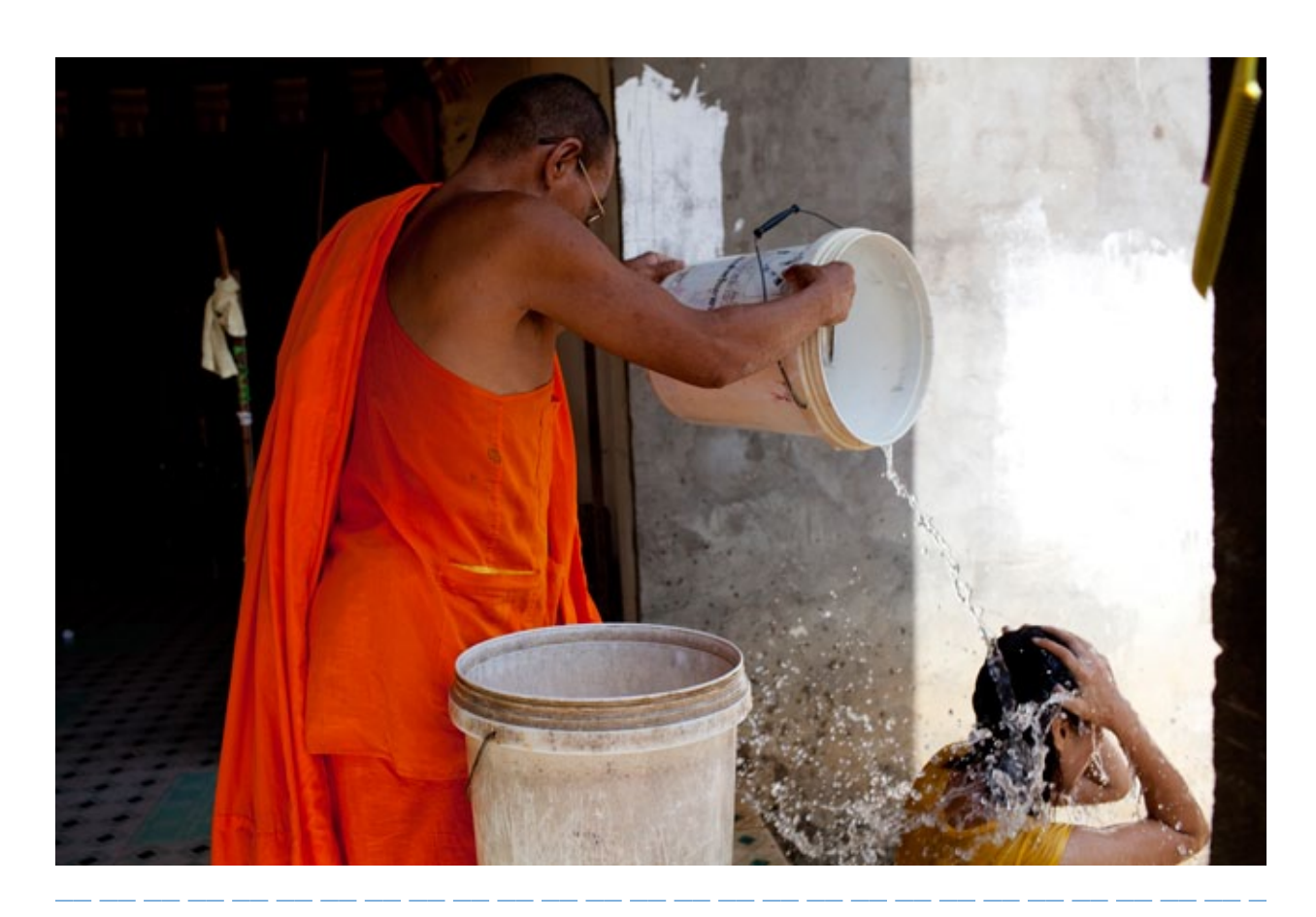
In light of the mental health system's shortcomings, the majority of Cambodians who need mental health services do not consult a trained mental health professional. Instead, many often turn to Buddhist monks or traditional healers for their mental health needs.

Moreover, the medications prescribed are often older generations of pharmaceuticals, which typically have greater side effects and lower efficacy.<sup>278</sup> "New medications are hard to find. It is too expensive. Mostly, I can only give the old medicine, not the new generation medicines," indicated a psychiatrist at the Siem Reap Referral Hospital.<sup>279</sup> Medication shortages are also frequent. Dr. Chak Thida noted that the Khmer-Soviet Friendship Hospital's three-month supply of medications allocated by the Ministry of Health is sometimes exhausted within a month.<sup>280</sup> Some health center staff stated that the Ministry of Health had simply stopped providing them with mental health medication altogether.<sup>281</sup> The medication shortage likely reflects both the lack of financial resources allocated to the mental health sector and