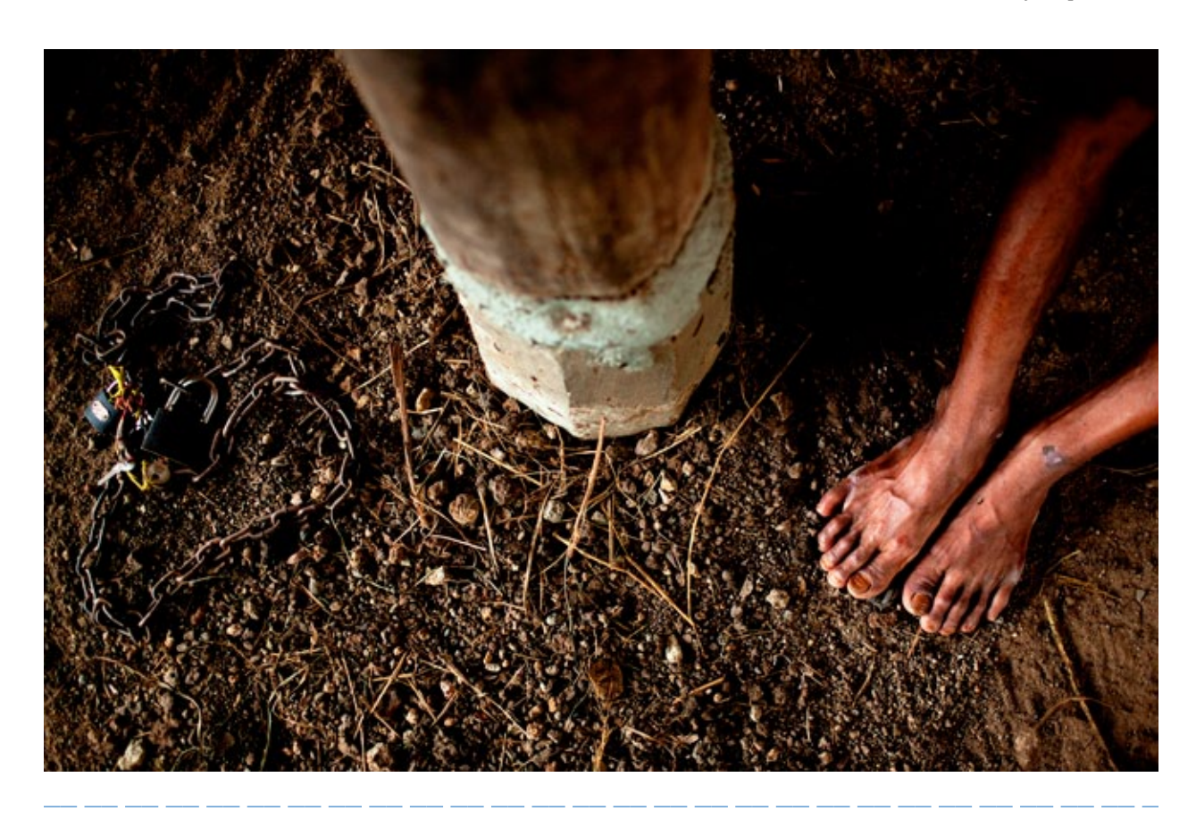
Deprived of community-based services and mental health education, interviewees reported feeling overwhelmed by having to care for their relatives with mental disabilities. Above, the beam and chain used by this mentally disabled man's wife to chain him outside their home.

Individuals are typically brought for detention to these centers in one of two ways: either the detainee's family pays the police to apprehend the detainee or the police round up the detainee in one of their periodic "street sweeps." 361 Persons with mental disabilities are especially vulnerable to these forms of extrajudicial detention. A Human Rights Watch representative reported that "Iflrustrated family members pay for the police to lock mentally ill family members up,"362 and that "the mentally ill are [also] detained because they are often homeless and because it is easy to put them