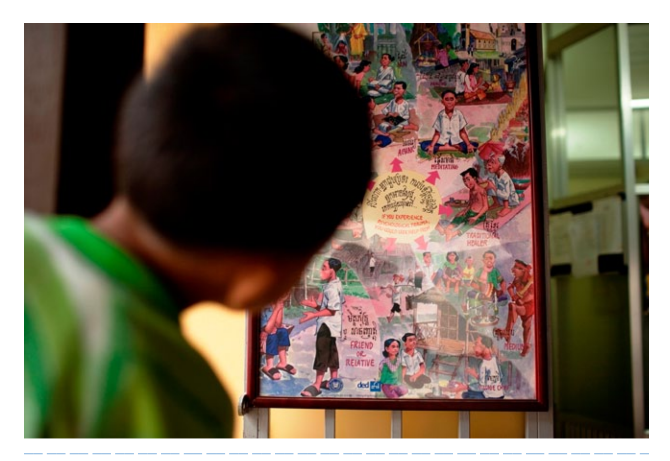
Cambodia, in particular, is home to an elevated number of risk factors for poor mental health. These include the trauma of the Khmer Rouge period, as well as more contemporary social factors, such as widespread poverty, high rates of violence against women, and a precarious human rights situation. Above, a child examines a mental health awareness poster at Preah Kossamak Hospital in Phnom Penh.

face a range of intersecting health and human rights issues. Worldwide, putative mental health institutions have been the site of atrocious human rights abuses. These include frequent reports of rape and sexual abuse, forced sterilizations, extended periods of chaining, violence and torture, the administration of treatment without informed consent, and grossly inadequate sanitation and living conditions.91 As a result, disability rights advocates and international health institutions, like the WHO, have recommended "mental health services, including support services, be based in the community and integrated as far as possible into general health services, including primary health care, in accordance with the vital principle of the least restrictive environment."92 This right to community integration, as it is commonly referred to,93 thus provides that states must take steps towards "ensurlingl a full package of community-based mental health care and support services conducive to health, dignity, and inclusion."94