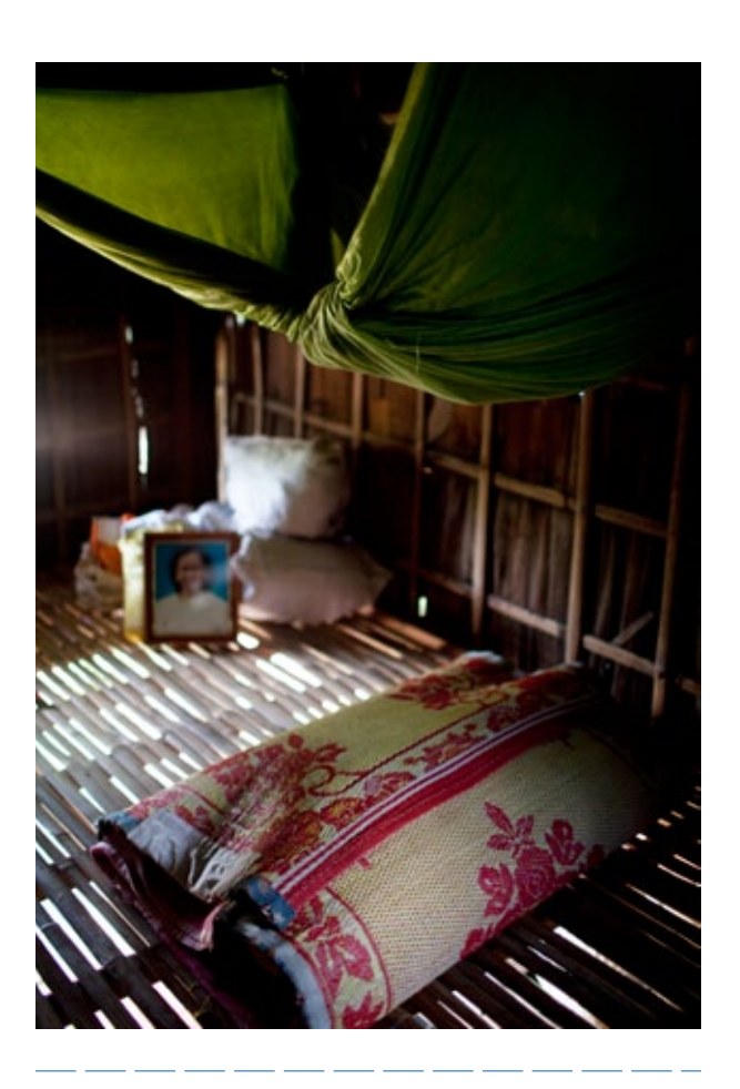
Mental health professionals estimated that between ten and forty percent of persons with severe mental disabilities are chained or locked in cages by their family members. A woman was locked in this bamboo cage for over two years by her relatives who felt they had no other options for her care.

The impact of Cambodia's mental health treatment gap goes beyond the right to health and implicates a broad range of interrelated human rights for persons with mental disabilities. Cambodia has modeled its mental health system on a decentralized, communitybased model that rightly rejects outdated notions that revolve around institutionalization.<sup>299</sup> In practice, however, such a community-based model requires a network of mental health treatment and support services, which Cambodia currently lacks. As a result, Cambodians with mental disabilities are largely left to their own devices or cared for by family or community members with few mental health resources. Predictably, where community integration becomes community abandonment, Cambodians with mental disabilities are particularly vulnerable to human rights abuses. The following Section expands the right to health lens to focus on three such interrelated human rights abuses identified by the delegation, namely chaining and caging by family members, community stigmatization and abuse, and detention in government prisons and extrajudicial facilities.