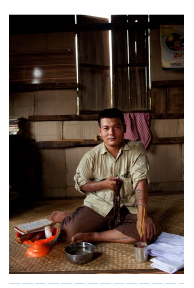
A traditional healer, a Kru Khmer, in Kampong Thom province.

Finally, Cambodians also may seek out one of a number of nongovernmental organizations that have tried to "fill the gaps" in the mental health sector by providing services, either directly or in partnership with public facilities.<sup>295</sup> Among the more successful of these nongovernmental organizations are TPO-Cambodia, Social Services of Cambodia, the Center for Child and Adolescent Mental Health, Psicólogos Sin Fronteras, the Ragamuffin Project, and Louvain Coopération. Unfortunately, there is little coordination among these organizations, which offer a patchwork of services to disparate target populations.<sup>296</sup> Further, given their limited funds, they can only reach a small