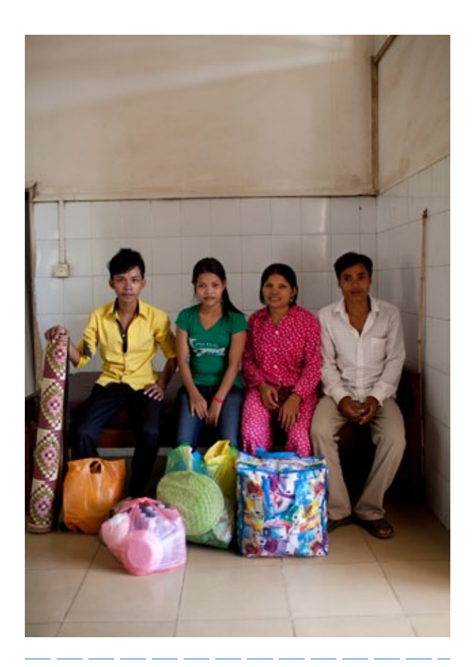
A mental health patient's family readying to leave the Khmer-Soviet Friendship Hospital in Phnom Penh.

The right to health is an inclusive right that encompasses underlying determinants, as well as access to a functioning system of health services.<sup>76</sup> The CESCR has recognized that the right to health "embraces a wide range of socio-economic factors that promote conditions in which people can lead a healthy life, and