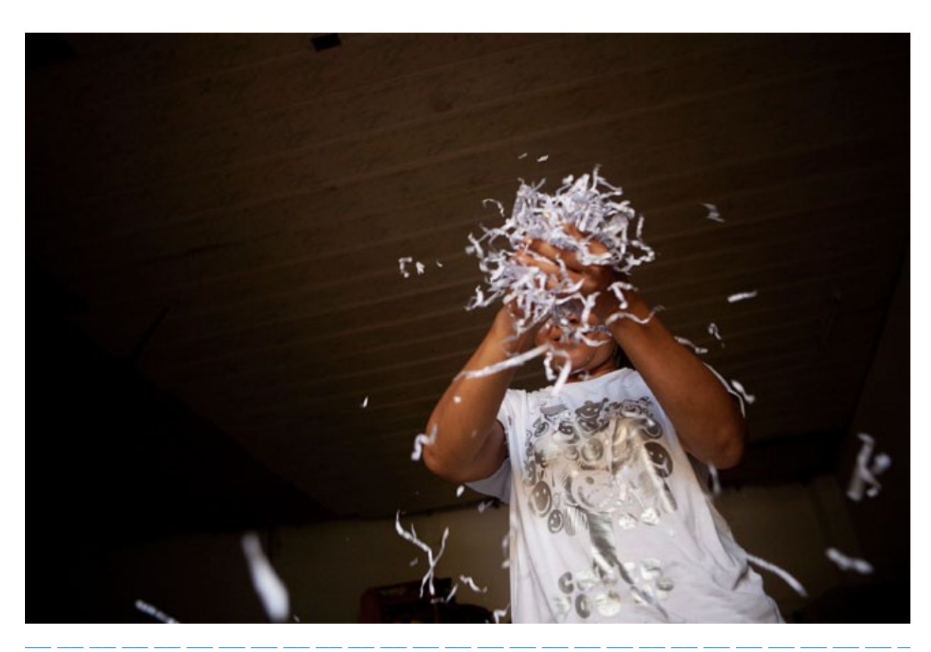
According to one mental health professional, domestic violence and family conflicts account for up to or over half of all her patients. Above, a woman tearing up paper to cope with the psychological stress caused by her relationship with her arranged husband.

Interviewees identified domestic violence as one of the principal factors driving women to seek out mental health services in Cambodia. 178 At one Cambodian hospital, a mental health professional told the delegation: